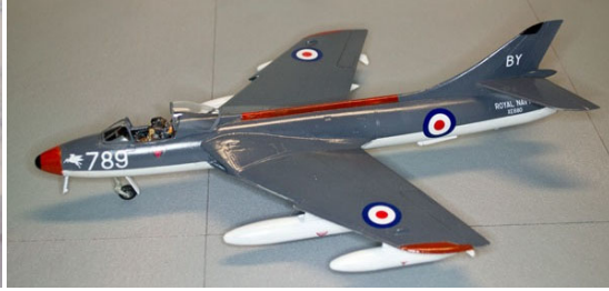
Hawker Hunter FGA.9 '789'

Three options for display case bases: mirror (CF-100), grass field (Bristol Blenheim), diorama: