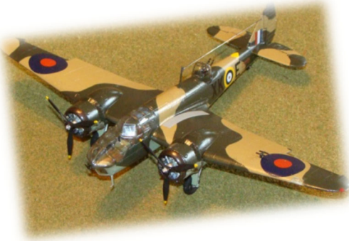
Bristol Blenheim Mk.IVf XK-E

This is an opportunity to commemorate a special aircraft, accompanied by a detailed research booklet covering its pilot and his specific aeroplane. All commissions come with a professional display case. All proceeds go directly and exclusively to the Centre. The eligible portion of your donation is tax-deductible.