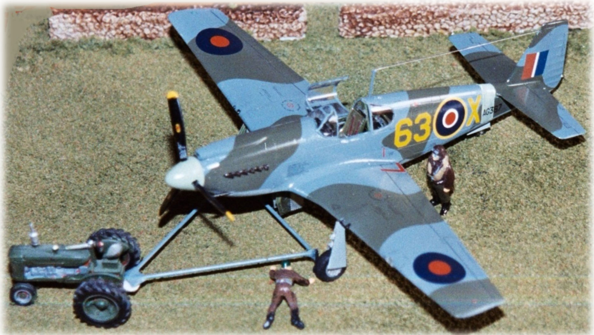
P-51 Mustang I 63-X, F/O Pierre Gervais, February 28, 1944

Three options for display case bases: mirror (CF-100), grass field (Bristol Blenheim), diorama: