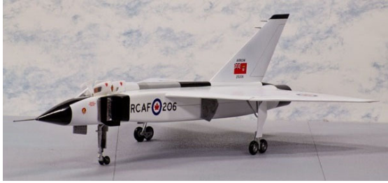
Avro CF-105 '206'